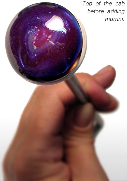
Top of the cab before adding murrini.

These tools are compatible with RICO DESIGN Sunset Blvd. rings & pendants, as well as silberwerk RingDing rings. Tool kits & a selection of rings and supplies can be purchased through contacting us at our online store: www.JetAgeStudio.com